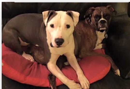
Flaco, (left), a 3-year-old gray and white male Pit Bull.

We are always looking for volunteers to transport or foster animals.