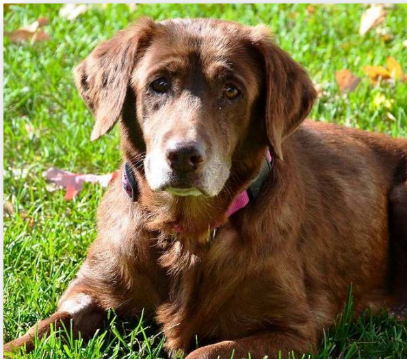
Lady Gaga, a current Rescue Labrador

Since January 1st, Ohio Labrador Retriever Rescue has re-homed 89 Labrador Retriever, six other breed dogs, 13 cats, 33, kittens, one white fox and one pot-bellied pig. It has been an extremely successful year for the organization, which is continuing to place animals with the help of volunteers and donations.