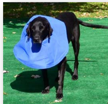
Licorice, following her surgery.